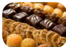
Wholesale Restaurant Services