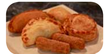
Empanadas, Croquetas & Pastel De Carne