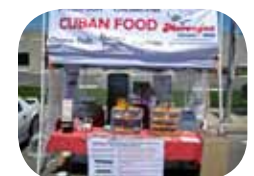
Mobile Merengue Booth